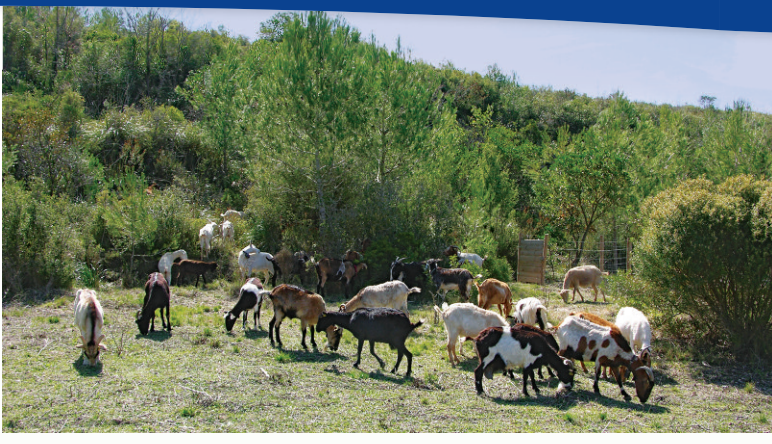
■ GOATS ARE BACK: One of the habitat management objectives for Garraf Natural Park is to recover grazing areas for goat flocks.

A broad habitat management project has therefore been initiated, the main goals of which are to accelerate natural regeneration through forest management; reduce stand density and increase stability; create a landscape mosaic by restoring open areas (grasslands, crops); restore specific habitats for fauna (water points, refuges); and restore farming